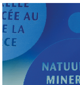
Brilliant colors and crisp print edges with UV inks. Printed with SEFAR PCF 120/305-34Y