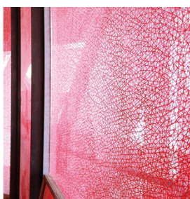
For a precise and durable print image on the glass facade with SEFAR GLASSLINE 68/175-95W