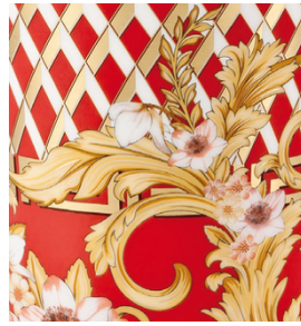
Great detail reproduction on ceramic decals (© Rosenthal) with SEFAR PET 1500