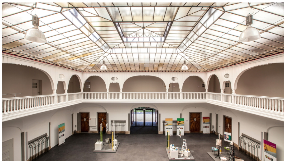
Sefar Competence & Training Center, Screen Printing

The intensive screen printing course covers a wide range of topics, from mesh selection and its impact on the print result, to the intricacies of the stretching process and how to optimize the printing process.