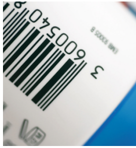
High density sharp edged bar codes printed with SEFAR PA