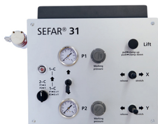
Universal, ergonomic and compact control unit in combination with SEFAR 3A