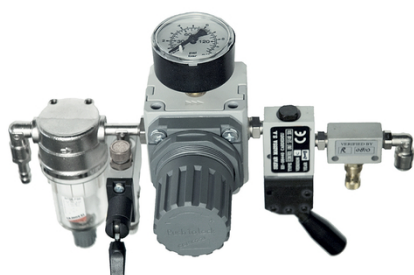
The simple control unit in combination with SEFAR 3A