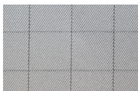
SEFAR TETEX MULTI 07-65-180 WA PHARMA

Sefar offers a complete range of special antistatic fabrics for the demanding application of fluid bed dryers. The fabric range has been adjusted to the various application requirements. Sefar fabrics are designed for an optimal balance between efficient particle retention and high throughput always guaranteeing perfect static dissipation.