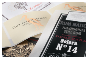
© Marbau GmbH & Co. KG