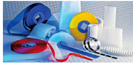
■ Fabricated & customer-specific products

For further information and fabric samples, please select the preferred contact option on the right.