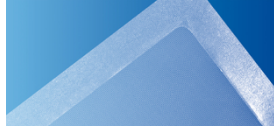
■ Wound care