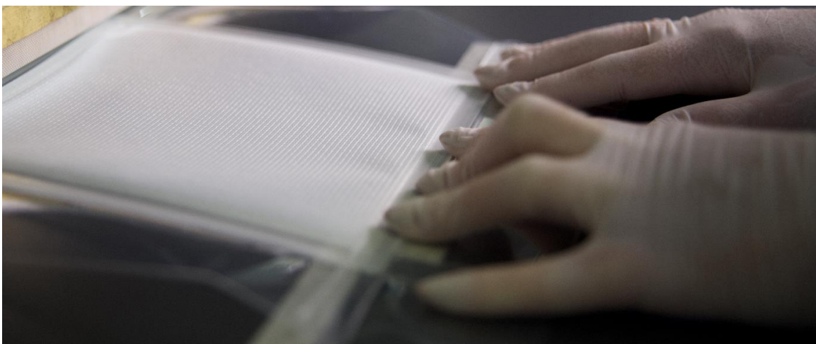
FIGURE 2: SEFAR'S THREE LAYER FILTER