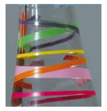
High density and sharp contours with SEFAR® PA 100/255-38Y