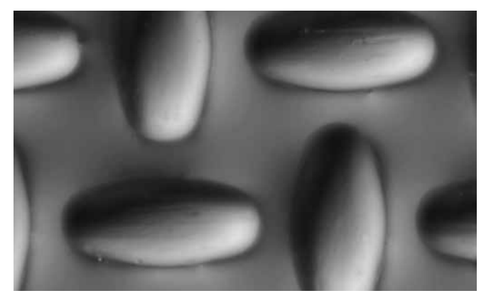
SEFAR® PA 120/305-35W after 5.000 prints

SEFAR® PA properties leave no wish unanswered: High elasticity; excellent abrasion resistance; very good adhesion of the stencil material and – in yellow – unsurpassed UV-A light undercutting protection.